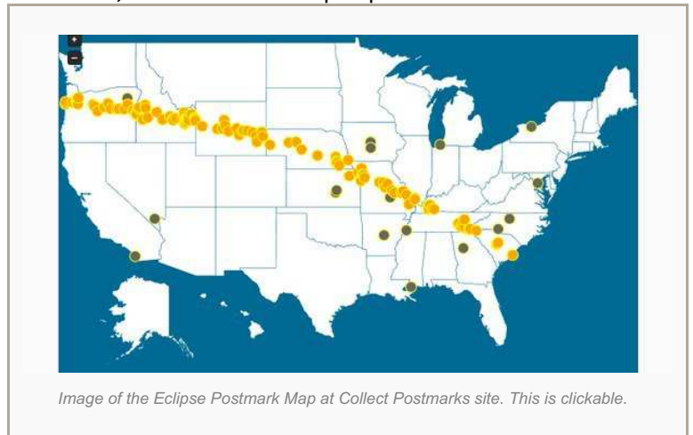
Image of the Eclipse Postmark Map at Collect Postmarks site. This is clickable.

AnchoredScraps daily blog post: Total Eclipse of the Sun Forever Stamp & Postmark , June 20, 2017, by Helen Rittersporn.